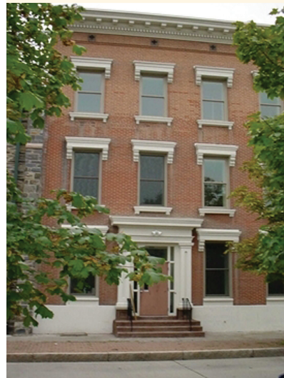
TLP is a supportive home-like setting for homeless youth.

TLP staff take on the role of a supportive family, as they advocate for youth and help remove any barriers to their education. They make sure youth have school supplies. They attend all school meetings with guidance counselors and teachers. They proofread papers, provide Internet access for research purposes, offer homework assistance and enlist tutors when needed. They also receive copies of report cards and discuss progress with each youth.